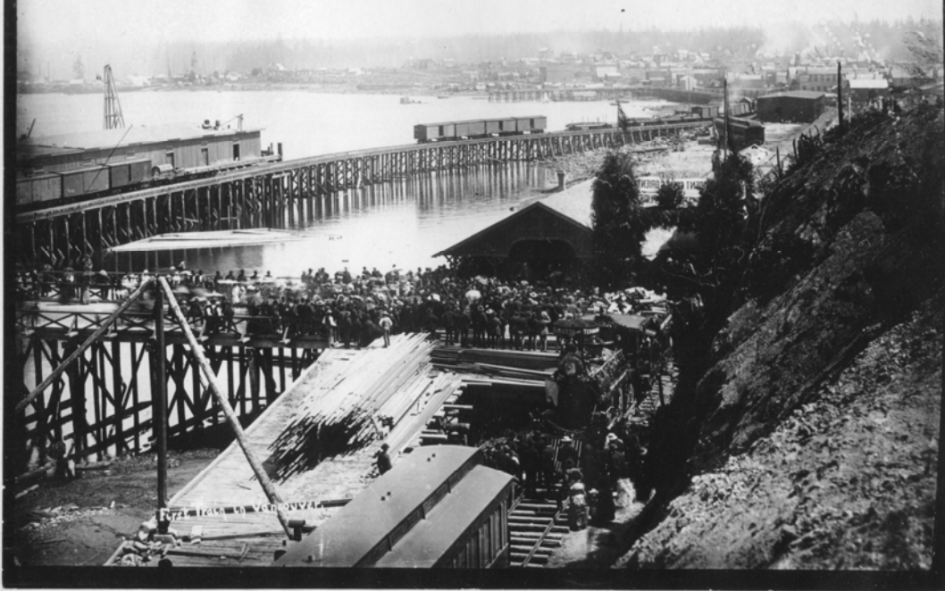
The station was almost exactly at foot Granville St