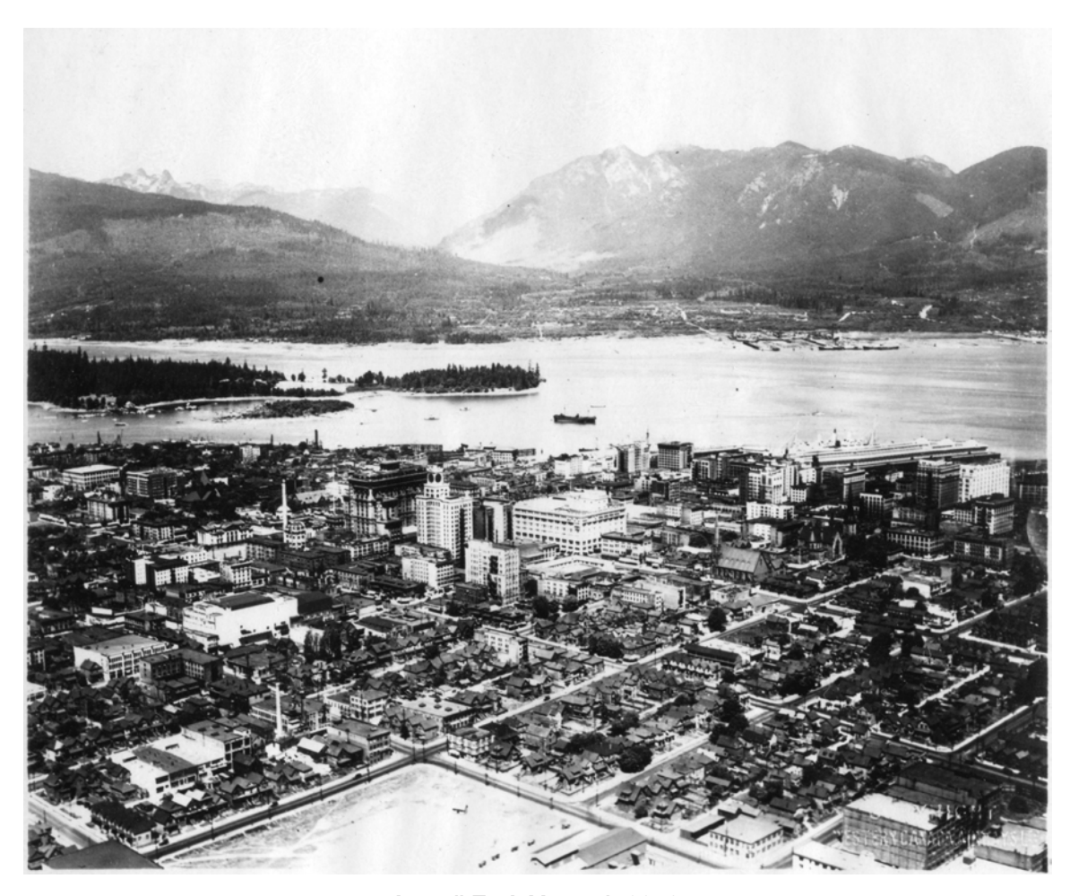
Item # EarlyVan_v1_0046