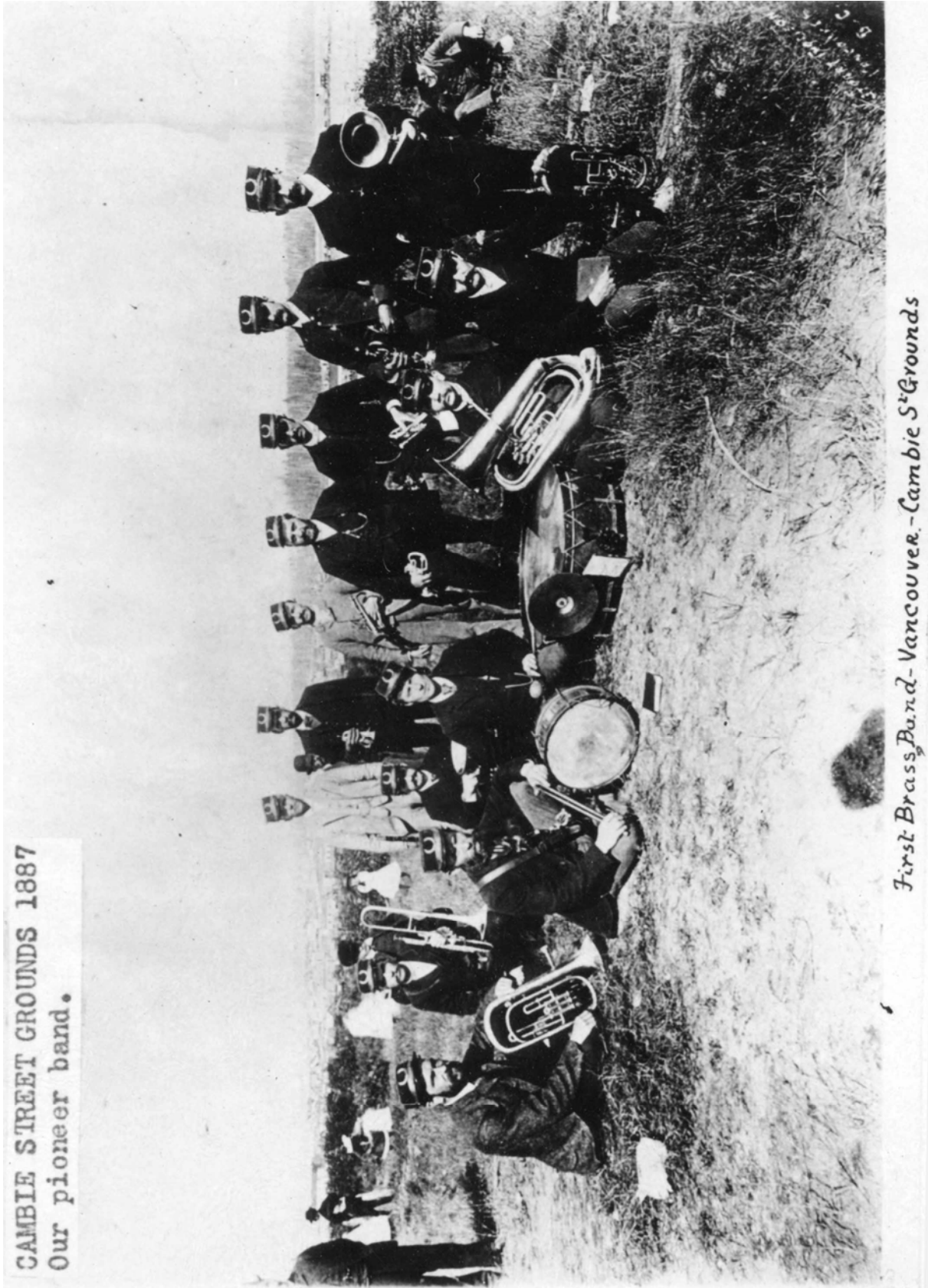
First Brass Band - Vancouver - Cambie St Grounds