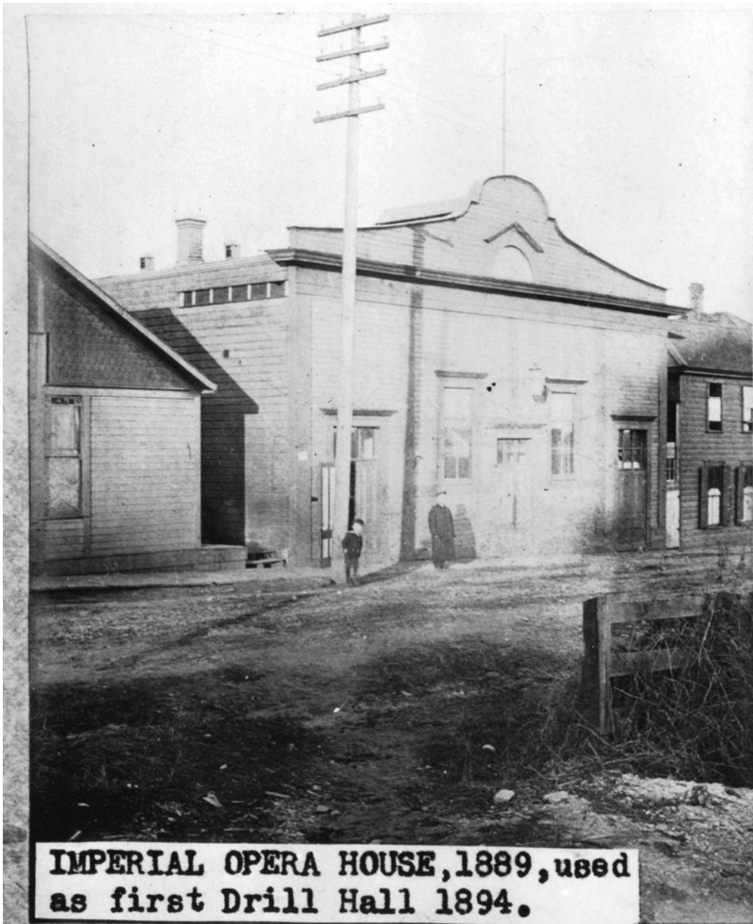
IMPERIAL OPERA HOUSE, 1889, used as first Drill Hall 1894.

x The Old Drill Shed (Formerly Imperial Opera House) now (1932) Whelly Building (part only) Foot of Beatty St Vancouver