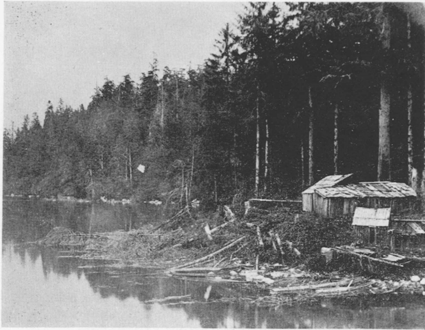
SQUAMISH INDIAN LODGE, 1868, NOW "LOST LAGOON"

Green lawns now slope gently down to "Lost Lagoon." Squamish Indian lodges were of thick cedar slabs split with deer's horn wedges, and built with stone hammers and stone chisels by Squamish Indian, the greatest natural carpenters in North America. Six "dugout" canoes lie at rest upon the beach.