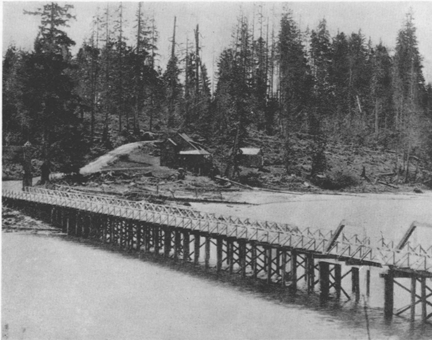
THE “WEST END” IN 1889

“After about three years, in 1868, he left the Hastings Sawmill and engaged in the fishing industry, and was in England organizing a company to construct a large salmon cannery at New Westminster when he died, January 1872. It is eminently fitting that he should be remembered, and especially so in this magnificent metropolis and port where he established the first industry on the south shore of Vancouver Harbour.”