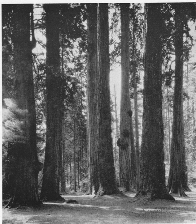
THE "SEVEN SISTERS," STANLEY PARK, 1920