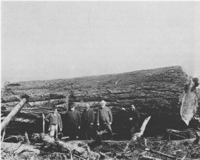
A RELIC OF THE FOREST

Green lawns now slope gently down to "Lost Lagoon." Squamish Indian lodges were of thick cedar slabs split with deer's horn wedges, and built with stone hammers and stone chisels by Squamish Indian, the greatest natural carpenters in North America. Six "dugout" canoes lie at rest upon the beach.