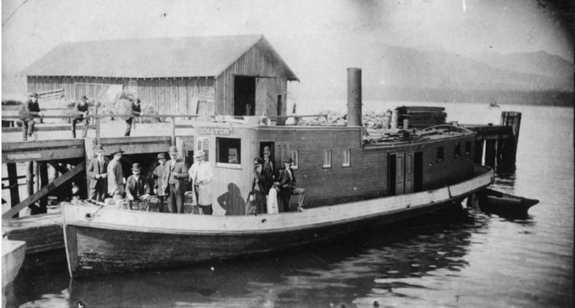
Item # EarlyVan_v1_0024