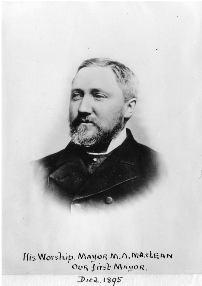
Item # EarlyVan_v1_00101