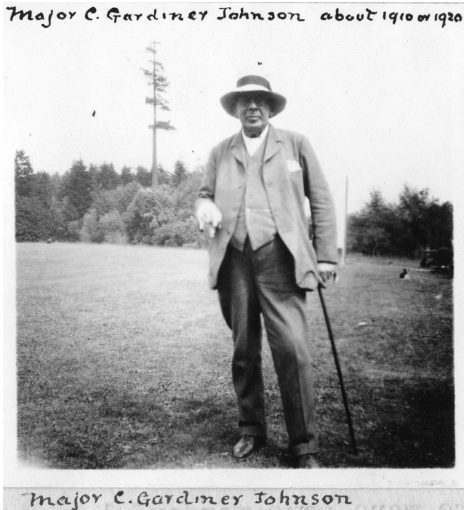
Item # EarlyVan_v1_0099